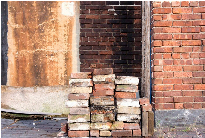
Another Happy Day#1© Rita Barros